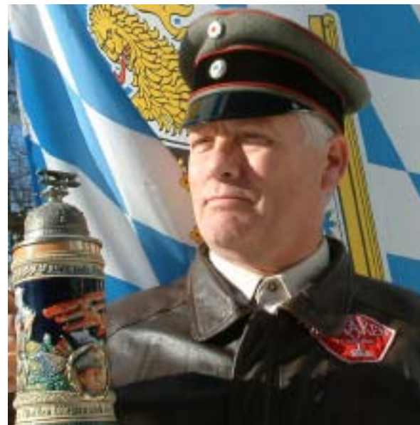
The current Morrisov recreates the scene at the Flitzer Werke.

The stein is now on display at the Connecticut Flitzer Werke in East Hampton, CT., which is resurrecting the Morrisov machine.