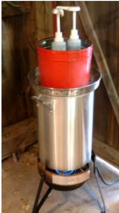
Keeping the glue warm...